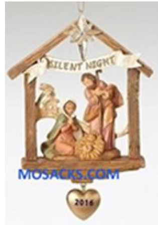
2016 Event Ornament Holy Family

Visit MOSACK'S on Saturday, Nov 12, 2016 for our Annual Fontanini Open House. All the new 2016 Nativity Sets, Stables, and Figurine are in stock. Special Pieces featured this year are: