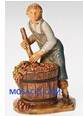
Limited Edition Dionysius Wine Maker

Online shoppers can view these special pieces and all the 2016 Fontanini Nativity Sets, Village Buildings, Stables, Figurines, Animals, Accessories, and more by visiting SHOP BY BRANDS / FONTANINI on our website: mosacks.com