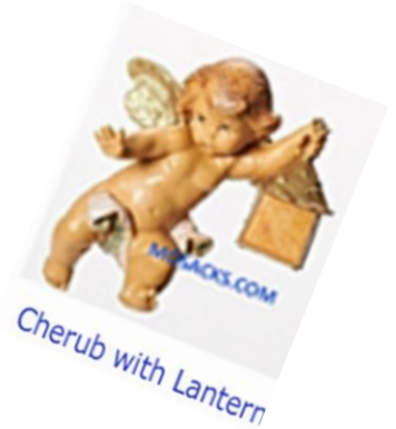
Cherub with Lantern